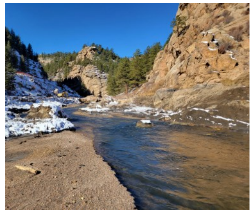
Lake George diversion dam after removal