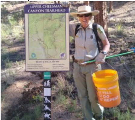
Forest Service South Platte River Patrol