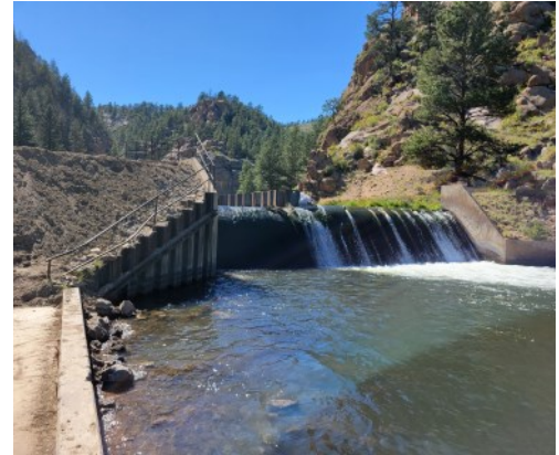
Lake George diversion dam before removal

Provide leadership to pursue appropriate recreational management opportunities