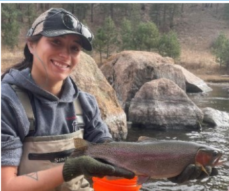
Improvements for Fish Habitat