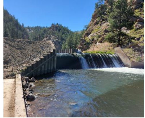
Lake George diversion dam before removal

Provide leadership to pursue appropriate recreational management opportunities