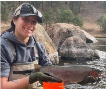
Improvements for Fish Habitat