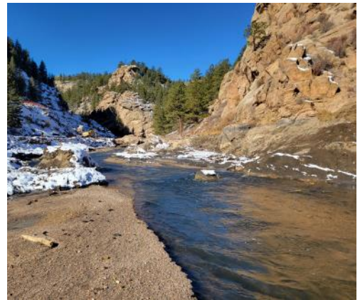
Lake George diversion dam after removal