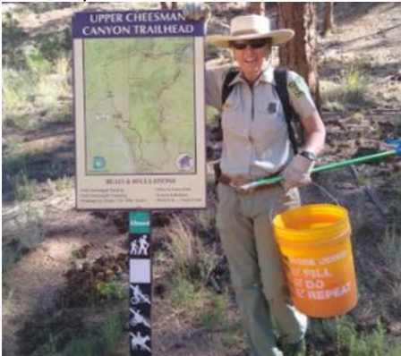
Forest Service South Platte River Patrol