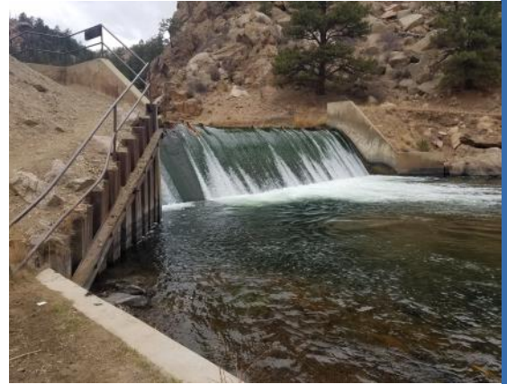
Lake George diversion dam removal

Provide leadership to pursue appropriate recreational management opportunities