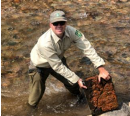
Forest Service South Platte River Patrol