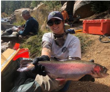
Improvements for Fish Habitat