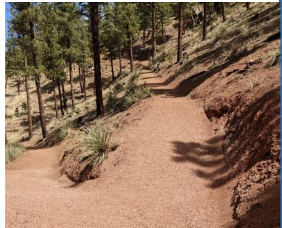
Gill Trail improvements