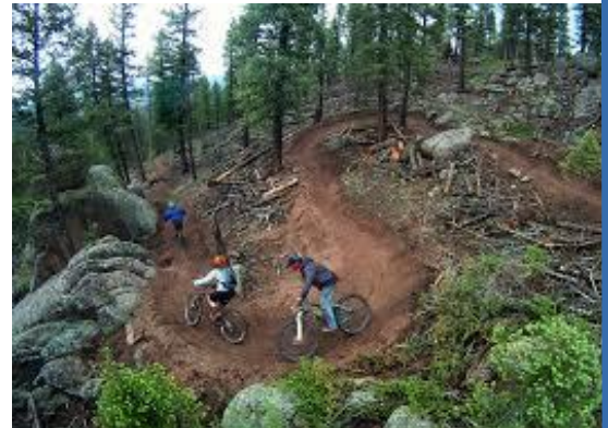
Buffalo Creek Recreation Area Improvements