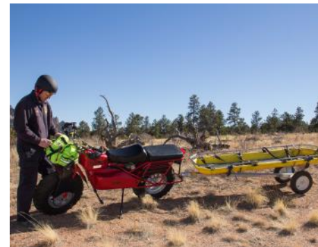
Purchase of a Rokon ATV and Rescue Trailer