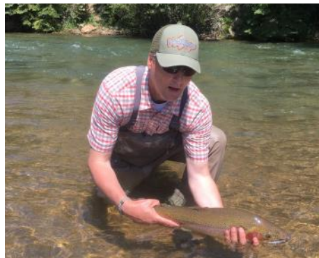
Improvements for Fish Habitat