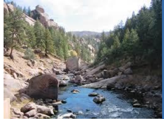
Baseline Study of Outstandingly Remarkable Value Conditions

Provide leadership to pursue appropriate recreational management opportunities